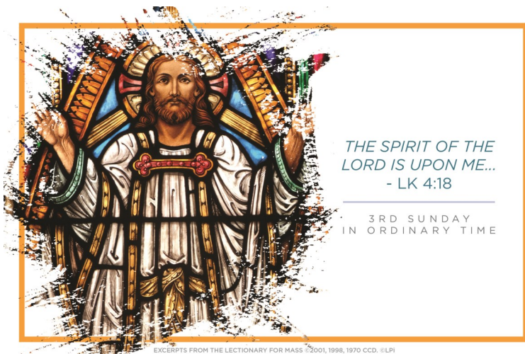
EXCERPTS FROM THE LECTIONARY FOR MASS ©2001, 1998, 1970 CCD. ©LPI