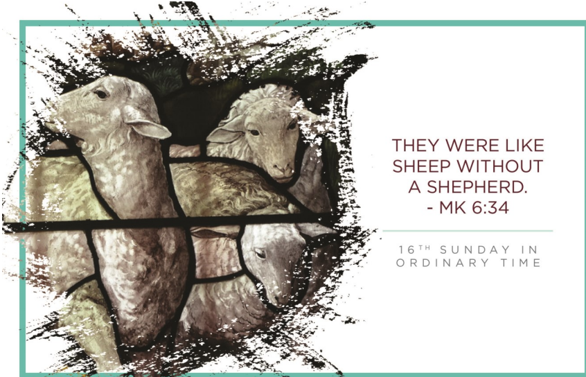
EXCERPTS FROM THE LECTIONARY FOR MASS © 2001, 1998, 1970 CCD. ©LPI