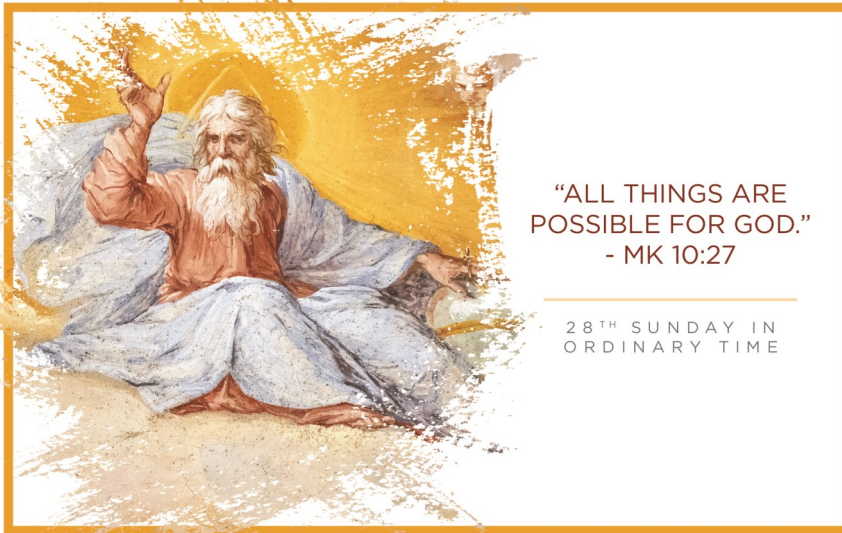
EXCERPTS FROM THE LECTIONARY FOR MASS ©2001, 1998, 1970 CCD. ©LPI