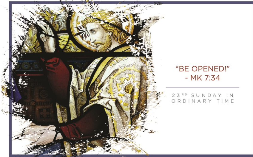
EXCERPTS FROM THE LECTIONARY FOR MASS ©2001, 1998, 1970 CCD. ©LPI

September 8, 2024 /8 de Septiembre, 2024